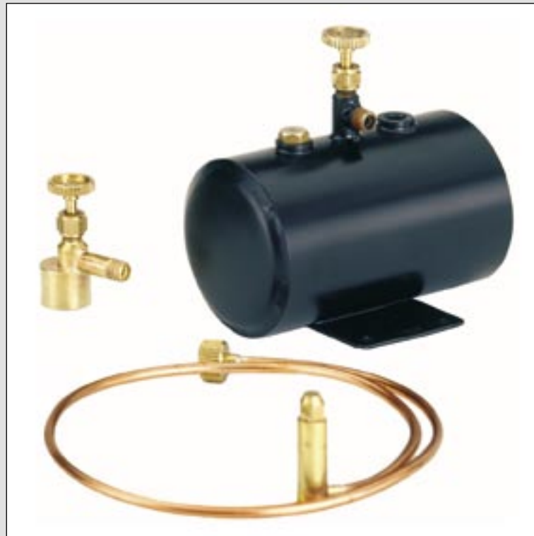
Gas Supply & Burners